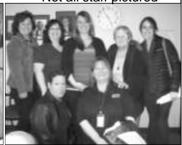
Not all staff pictured